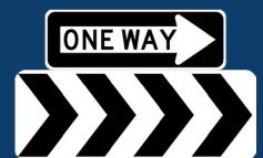
Roundabout traffic travels one way.